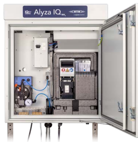
Alyza IQ NH 4 HR

The trigger function enables event-controlled sampling with close monitoring. In combination with a longer standard interval, you can adapt the measuring frequency to your individual requirements. The following pages show examples of the different operating modes. For details, such as connecting a trigger cable, settings for the filtration pump or the measuring interval, please refer to the operating instructions for the Alyza IQ NH 4 HR.