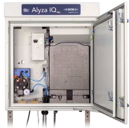
Alyza IQ NH 4 HR on the web: